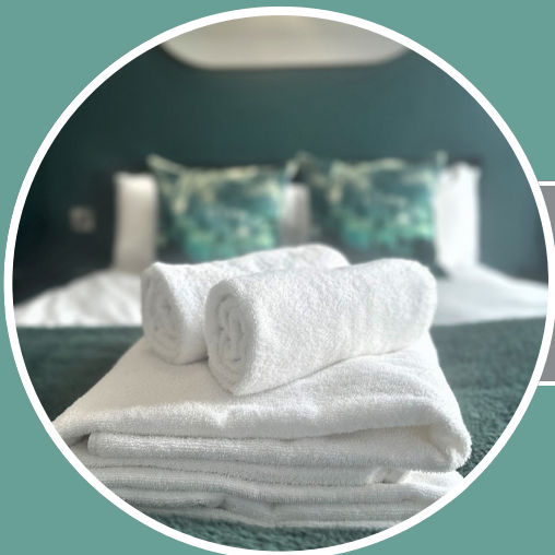
Harbourside Hideaway by Tom