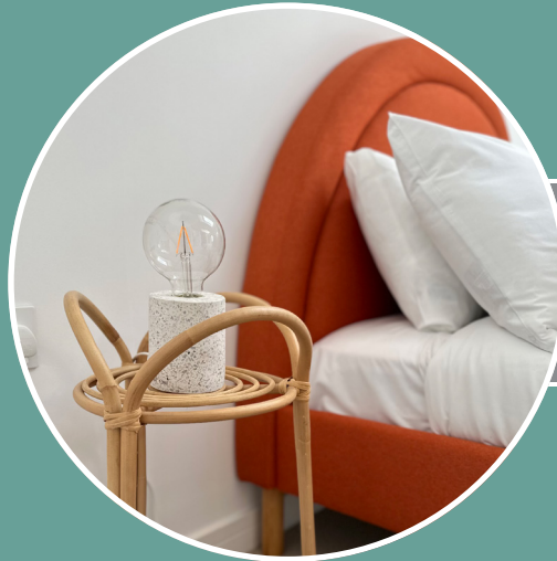
Ideal Getaway by Faye