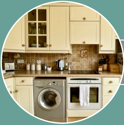
Cosy Boutique Apartment by Amber